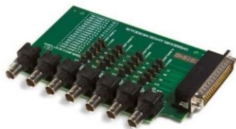
Bench Top Break Out Jig